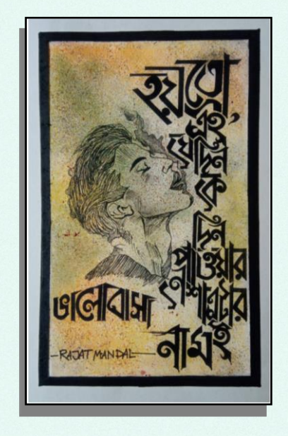
RAJAT MANDAL |2<sup>ND</sup> YEAR|ME |PENOGRAPHY|