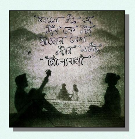
PARAMITA SAHA |3<sup>RD</sup> YEAR|ECE |PENOGRAPHY|