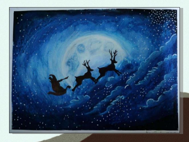
MAINAK BANERJEE | 2<sup>ND</sup> YEAR | ECE | DRAWING |