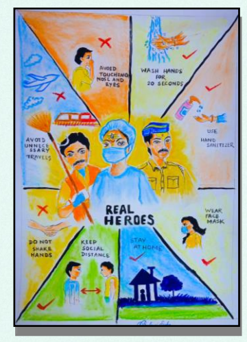
PROLOY SAHA|3<sup>RD</sup> YEAR|EE |POSTER MAKING|