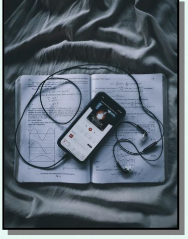
SWASTIK BHATTACHARYA | 2<sup>ND</sup> YEAR |CSE|PHOTOGRAPHY|