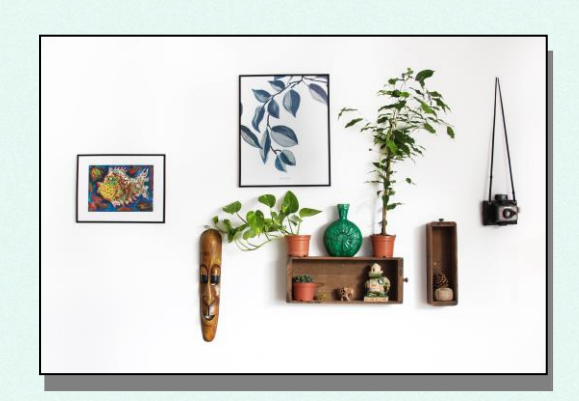
SUBHAJIT MONDAL |BATCH-'21|ECE |PHOTOGRAPHY|